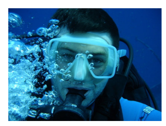
Rule#3- Breathe Efficiently: One of the first diving rules you learn is to never hold your breath. And certainly don't. To significantly improve your breathing efficiency, reverse your normal breathing pattern from inhale-exhale-pause to inhale-pause-exhale- -the pattern many experienced divers adopt naturally over time. What you have to keep

(Note: moving more slowly also lets you see those little critters that the speed demons just steam past.)