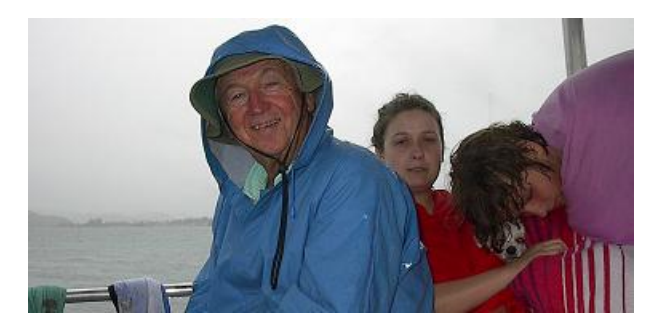
1953 - E.R. Cross publishes the immensely popular Underwater Safety .

1953 - Popular Science gives directions on how to make your own scuba equipment using surplus military parts. Think this would work Charlie?