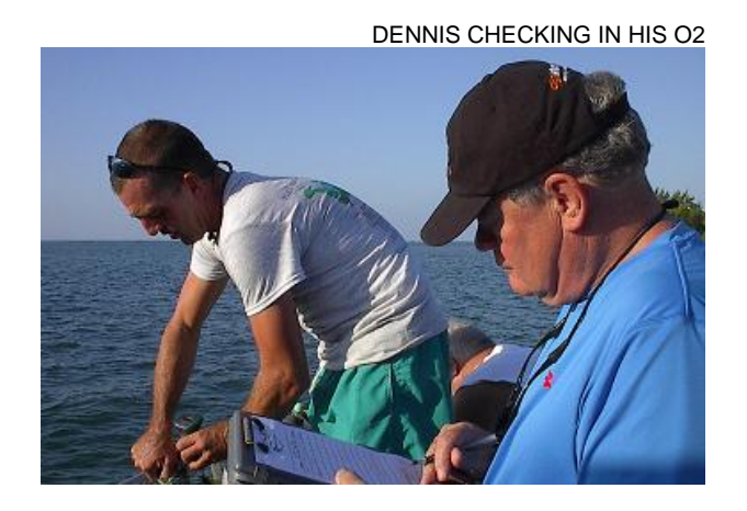
Scuba Safety Gear