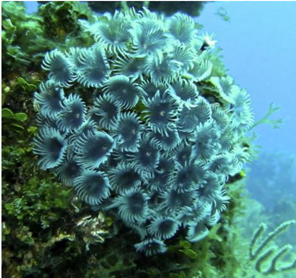
GENERAL MEMBERSHIP MEETING 10 June 2014

There being no further business, the meeting was adjourned at 9:33 PM.