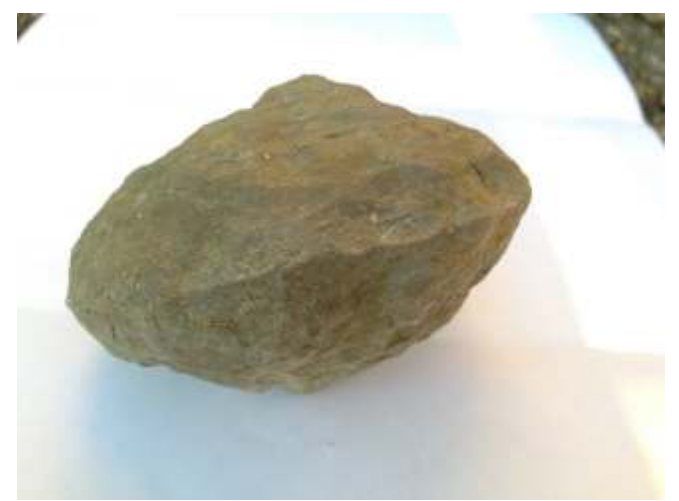
It is shaped comfortably for the hand and has a very sharp edge with chip indications on each side. My boat mates insist it is just a geode. Any experts out there? Bart