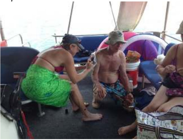
is first mate tattoo and