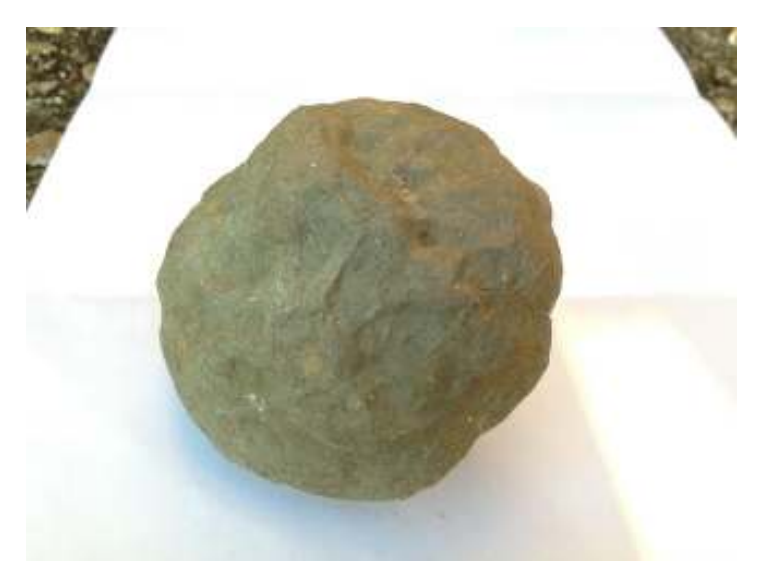
I found this fist size rock about 30 ft down on a rocky ledge along the shoreline. It really stood out as peculiar