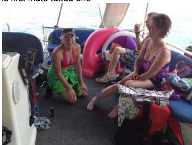
happy with her work