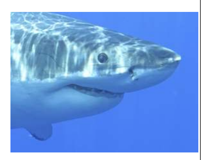
...cold lifeless eyes... doll's eyes