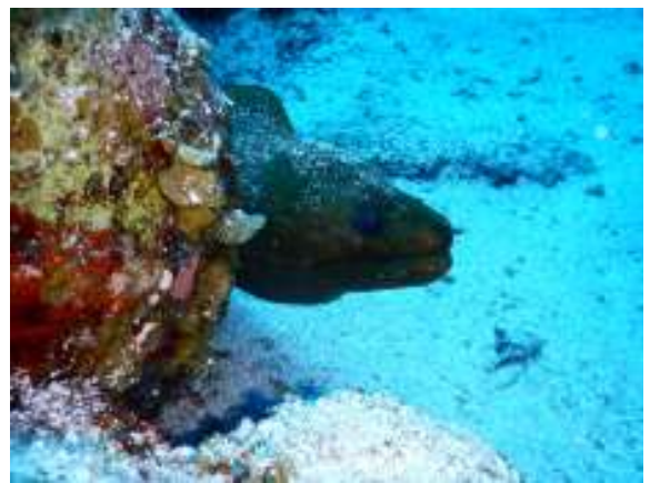
this guys must be tired of the shark frenzies outside his door tossing sand all over the place