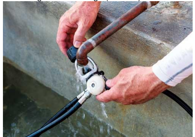
2. Use a gentle stream of water to rinse debris and salt residue from the regulator.

Using a hose for a fresh-water rinse is the first method of cleaning our gear. The scuba unit should still be fully assembled and turned on. First, gently spray the unit to remove any dirt or salt residue ( Photo 1 ). Now individually rinse each part of the regulator. Run a gentle stream on the regulator first stage ( Photo 2 ).