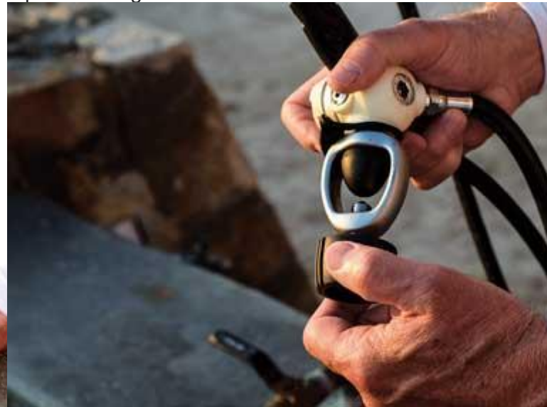
5. Make sure the dust cap is securely covering the first-stage air inlet before rinsing or soaking the regulator system.

In some instances it is not possible to thoroughly rinse the regulator unless it is removed from the scuba tank valve. After removing the regulator from the tank, carefully dry the dust cover and place it over the first-stage air inlet. Now finger tighten the yoke screw to secure the dust cover ( Photo 5 ). This keeps the water from entering the first stage when rinsing the regulator. From this point on, use the same procedure listed above under the topic of rinsing with a hose.