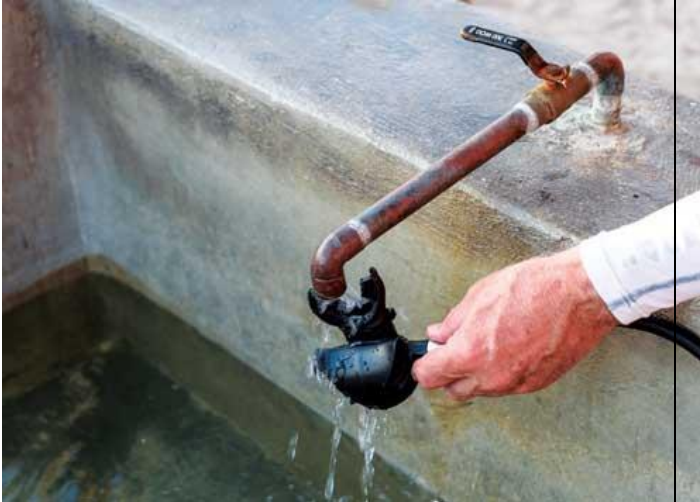
3. Guide a stream of fresh water into the regulator mouthpiece allowing water to drain from both sides of the exhaust tee.

Rinse the gauge/computer console and the swivel connection where the gauge attaches to the hose ( Photo 4 ). Rotate the console while streaming water around the entire outside. Repeat this step on both second-stage regulator hoses and the low-pressure buoyancy compensator (BC) inflator hose.