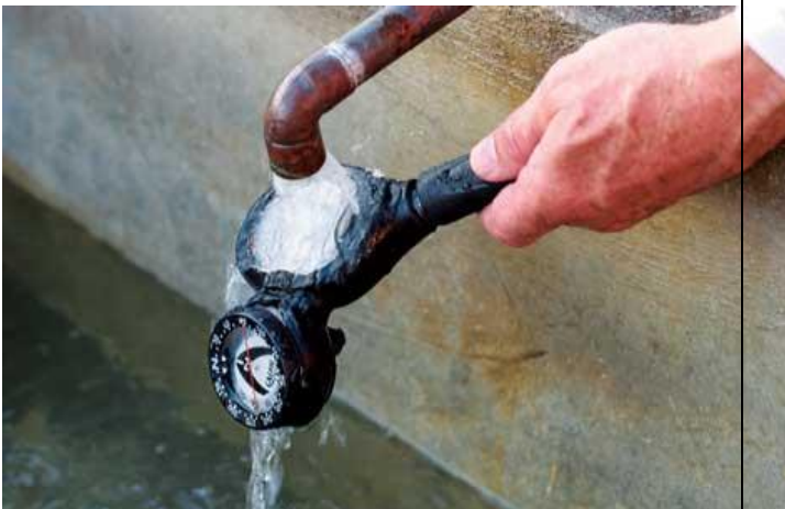
4. Rinse the gauge/computer console and the swivel connection where the gauge attaches to the hose.

Rinse the gauge/computer console and the swivel connection where the gauge attaches to the hose ( Photo 4 ). Rotate the console while streaming water around the entire outside. Repeat this step on both second-stage regulator hoses and the low-pressure buoyancy compensator (BC) inflator hose.