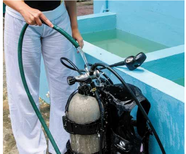
1. Gently spray the entire scuba unit with water to remove any dirt or salt residue.