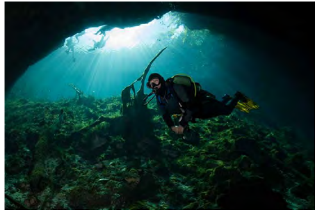
Good finning techniques and proper buoyancy can help prevent Silt-outs

Your finning technique, buoyancy, and horizontal trim is critical in this respect. The preferred finning technique in areas where silt is present is the bent-knee cave diver or frog kick. Good buoyancy control will mean that you don't accidentally hit the bottom (or the ceiling of a cave or wreck, where silt also can be lodged). Horizontal trim, the ability to stay level in the water, will help keep your legs and fins off the bottom, where it can disturb the silt. If you unable to trim, do not enter potential silt-out conditions.