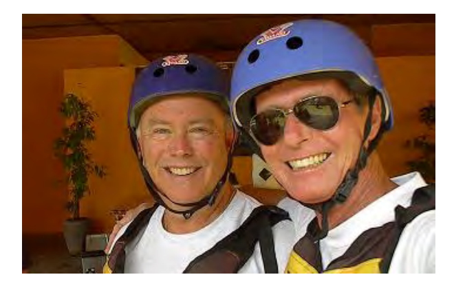
Q: Can the coronavirus survive inside the bladder of a BCD? What are DAN's recommendations for oral inflation?

will enter the second stage and potentially contaminate the inside of the regulator. If not properly disinfected, this could cause infection of the next person to use the regulator. Proper disinfection should be used in addition to providing individual mouthpieces.