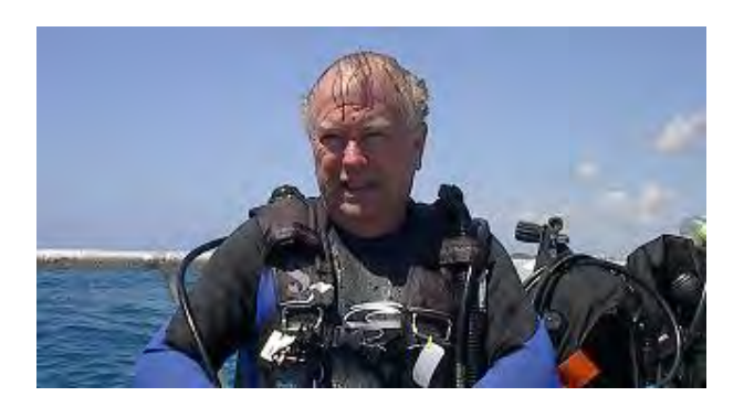
Q: If I run my compressor, is there a chance that the compressed air inside my cylinders could be contaminated? Can the new coronavirus get into my filled cylinders?

properly disinfected, rinsed with fresh, clean water, and allowed to dry. In the case of specifically, masks alcohol or other disinfectant wipes could be used for disinfecting. It is recommended that wetsuits not be available to try on. However, if this is really necessary, they should be removed from sales stock following fitting and stored for nine days to allow the virus to die naturally.