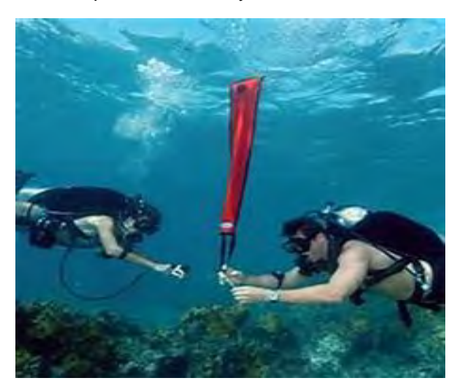
See ya down there, hopefully sooner than later, Bart

Finally, and most importantly, you must practice with your SMB occasionally. Practice in a pool or in the shallows as soon as you get it. Make adjustments as necessary so you'll have no problems when you need to use it.