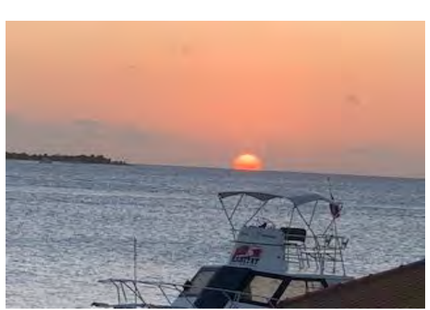
Sunset in Bonaire March 2020