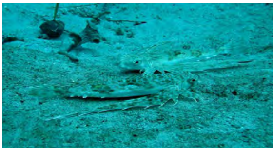
Tw o lovers (flying gurnards). Philippines

Renewal: Please send payment to the address listed below, please make sure there is a correct indication of your mailing address, phone number and it is very important to indicate an email address.