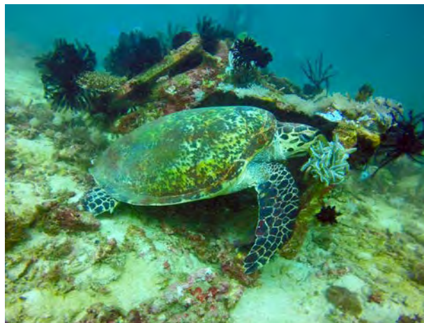
BlueGrass Dive Club Philippines Trip 2016