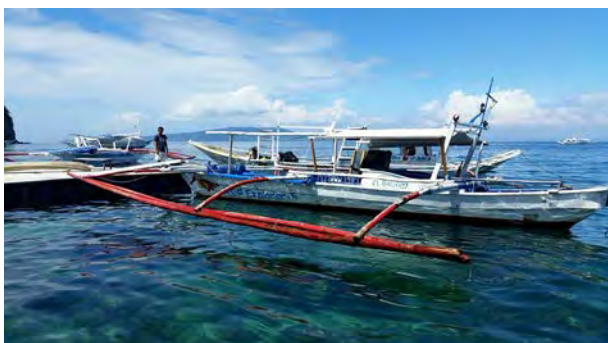
Dive Boats - Philippines Trip Feb. 2016