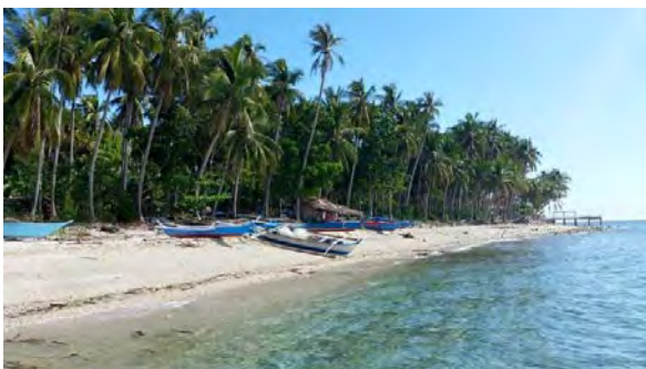
Verde Island, Puerto Galera, Philippines

Now is a perfect time to suggest a dive location you always hoped the club would book a trip to! 🚩