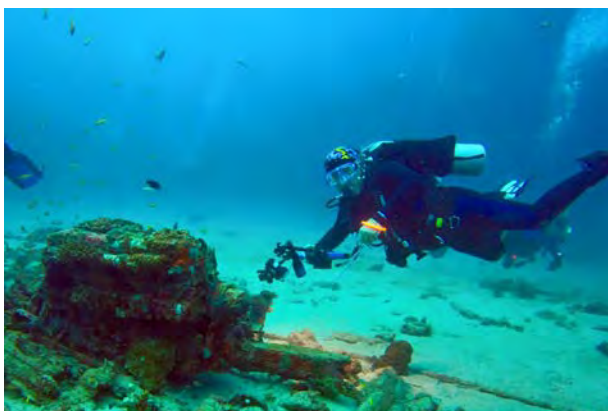
Philippines Trip February 2016

Looking forward to seeing everyone at the next zoom meeting! Working on programs that I hope you will enjoy. If you want to hear about a certain topic, please let me know. Hope to keep the meetings fun and interesting. Please see the calendar for meeting dates. 🚩